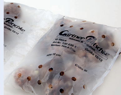
THERMAL TRANSFER (TTO)