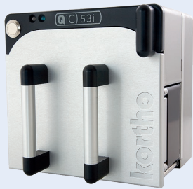
THERMAL TRANSFER (TTO)