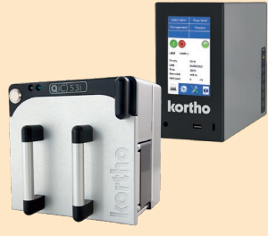
Thermal Transfer printers