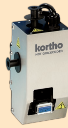
Hot Solid Inkcoders