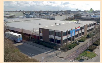
Headoffice and production in Holland