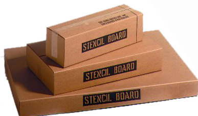
Stencil Board in several flexible sizes