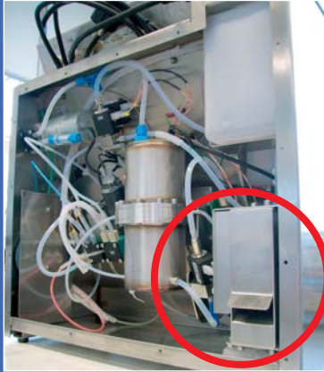
ECOSolv is completely integrated in the JET 2 SE