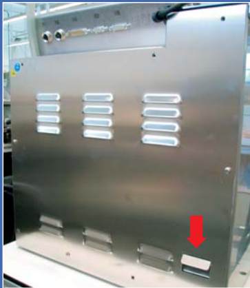
With the closed back you can only see the outlet of the air duct.